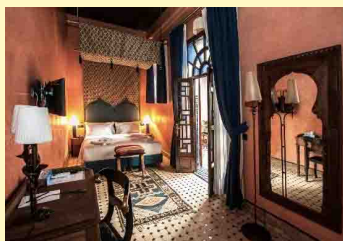
Stunning Riad hotel, Fes