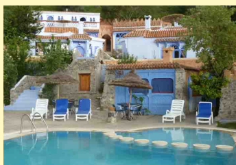
Village hotel, Chefchaouen

Accommodation: Our accommodation has been carefully selected and it's a highlight of our tour. In Fes and Marrakech we stay in traditional Riads, now converted into boutique hotels. In Chefchaouen we stay in a lovely village hotel. In N'kob we stay in an authentic Kasbah, and our two-night stay at Ait Benhaddou is always a huge hit. In Essaouira we stay in a boutique hotel just a few minutes walk from the main square. Some of our hotels have pools and all exude charm and character.