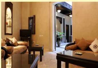
Boutique Riad, Marrakech

Food and drink: Breakfast is included every day and some other meals are included where there are no other options. Elsewhere, we enjoy the great variety of local food on offer. Soft drinks are widely available, but alcohol can sometimes be hard to find – particularly away from the major cities.