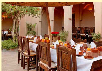
Authentic Kasbah, N'Kob