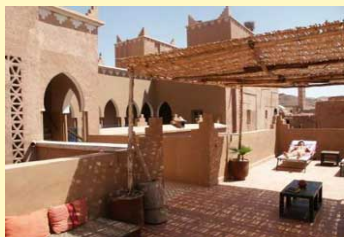
Boutique Kasbah, Ait Benhaddou