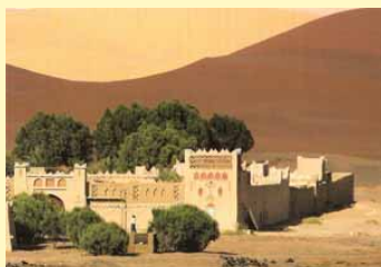
Desert hotel in the Sahara