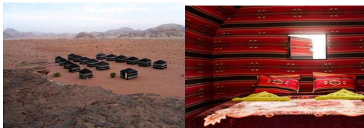
Atmospheric Bedouin Camp in the stunning desertscape of Wadi Rum