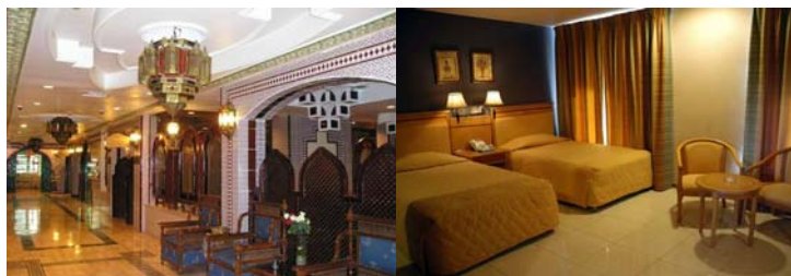
Eco Friendly 3+ Star, Amman

Accommodation: Hotels in Jordan tend to be quite new and modern in their design with few boutique style hotels available. What you can be assured of is that they will be clean, comfortable and well run. In Amman we stay in an atmospheric 3+ star hotel with an arabic feel while on the Red Sea at Aqaba our hotel is a modern classic style. Our comfortable Bedouin Camp in Wadi Rum is set amongst stunning desert scenery and is an unforgettable experience. During our stay in Petra our top rating hotel is located just 100m from the entrance to the Heritage site. It's renowned for its friendly staff and excellent service.