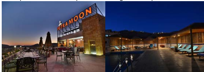
Comfort & Charm at the gates of ancient Petra

Food and drink: Breakfast is provided each day, along with 1 lunch and 1 dinner. Beer, wine & spirits are available at selected locations whilst soft drinks, juices and bottled water are available throughout.