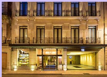
Colonial 4* hotel in Mexico City

Accommodation: We have selected some great hotels for this trip. Mostly they are charming 3 and 4 star colonial style hotels in great locations. In Mexico City we stay right next to the Zocalo Square whilst in San Cristobal our hotel is in the historical centre close to the main church. Many of our hotels have a swimming pool to cool off in at the end of the day and our hotel in Playa del Carmen is only a 3 minute walk to the beach.