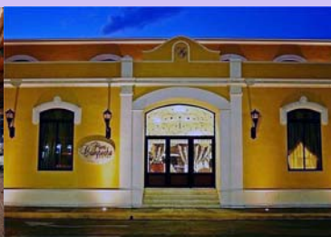
Historical hotel in Campeche