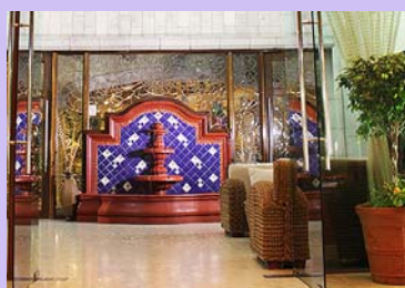
Hacienda Real – Playa del Carmen