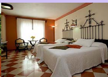
Comfortable rooms in Merida

Food and drink: Breakfast is included each day. Elsewhere, we enjoy the great variety of local food on offer. Beer, wine, spirits, soft drinks, tea, coffee and bottled water is all widely available.