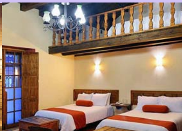
Charming rooms in San Cristobal