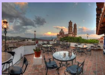
Hotel terrace in Taxco