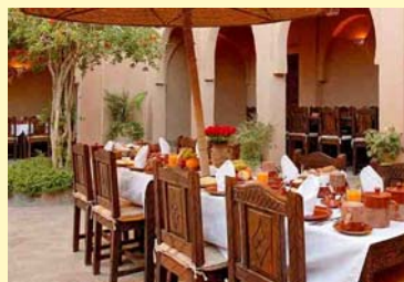
Authentic Kasbah, N'Kob