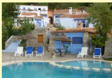
Village hotel, Chefchaouen

Accommodation: Our accommodation has been carefully selected and it's a highlight of our tour. In Fes and Marrakech we stay in traditional Riads, now converted into boutique hotels. In Chefchaouen we stay in a lovely village hotel. In N'kob we stay in an authentic Kasbah, and our two-night stay at Ait Benhaddou is always a huge hit. In Essaouira we stay in a boutique hotel just a few minutes walk from the main square. Some of our hotels have pools and all exude charm and character.