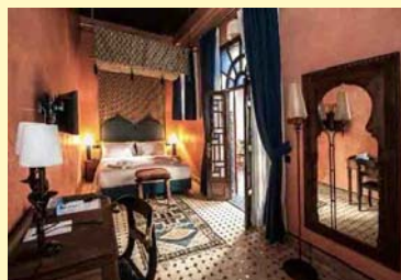
Stunning Riad hotel, Fes