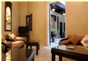
Boutique Riad, Marrakech

Food and drink: Breakfast is included every day and some other meals are included where there are no other options. Elsewhere, we enjoy the great variety of local food on offer. Soft drinks are widely available, but alcohol can sometimes be hard to find – particularly away from the major cities.