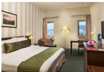
Quality 4 Star, Muscat

Accommodation: Hotels in Oman and Jordan tend to be quite new and modern in their design with few boutique style hotels available. What you can be assured of is that they will be clean, comfortable and well run. In Muscat and Niwas we stay in quality 3+ and 4 star hotels and at the Ras al Jinz Turtle Reserve we have comfortable seaside cabins. Our comfortable Bedouin Camps in Wahiba Sands and Wadi Rum are set amongst stunning desert scenery and are an unforgettable experience. During our stay in Petra our top rating hotel is just 100m from the entrance to the Heritage site. It's renowned for its friendly staff and excellent service.