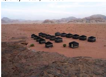
Atmospheric Tented Campsites in Wahiba Sands and Wadi Rum