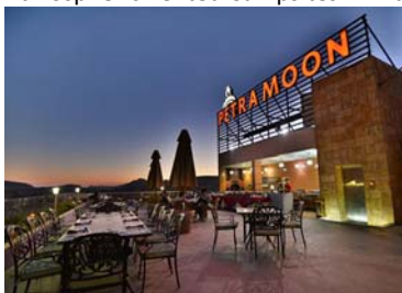
Comfort at the Gates of Petra