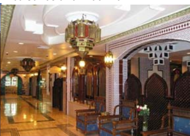
Eco Friendly 3+ Star, Amman

Food and drink: Breakfast is provided each day, along with 3 lunches and 1 dinner. Beer, wine & spirits are available at selected locations whilst soft drinks, juices and bottled water are available throughout.