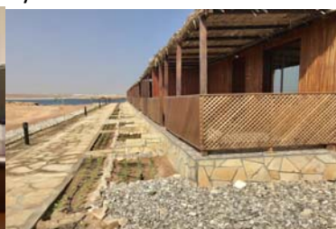
Seaside Comfort at Ras al Jinz