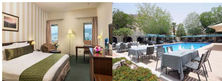
Quality 4 Star, Muscat

Accommodation: Hotels in Oman tend to be reasonably new and modern in their design with almost no boutique style hotels available. What you can be assured of is that they will be clean, comfortable and well run. In Muscat and in Niwas we stay in quality 4 star hotels, both with swimming pools. Our comfortable tented desert camp in the Wahiba Sands is set amongst stunning desert scenery and is an unforgettable experience whilst over on the Arabian Sea at the Ras al Jinz Turtle Reserve we have comfortable seaside cabins that make for a relaxing stay.