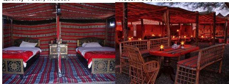
Atmospheric Tented Campsite in the stunning Wahiba Sands