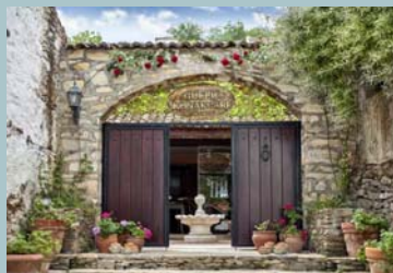
Sirince Village Boutique Hotel