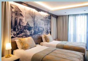
Luxurious Comfort in Istanbul

Accommodation: The accommodation is a particular highlight of this trip and each property has been carefully selected. In Istanbul we stay in a very well located boutique hotel just minutes from the Blue Mosque. In Sirince we overnight in a charming village house and in Safranbolu we experience a typical Ottoman style hotel in the centre of town. At Amasya we relax at a boutique spa hotel and in Goreme we stay in an atmospheric cave-style hotel, with great views of the village.