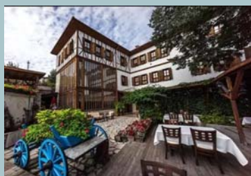
Ottoman Style, Safranbolu