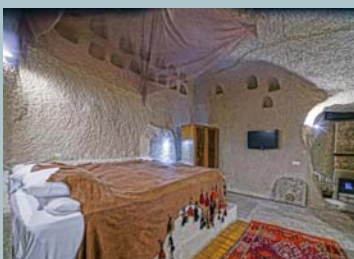
Cave Suite, Goreme

Food and drink: Breakfast is included every day. For most lunches and dinners you are free to enjoy the great variety of tasty and inexpensive food. Bottled water can be found everywhere and the normal range of soft drinks is available, along with beer and a good selection of Turkish wines.