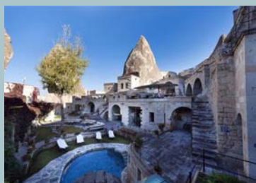
Cave Hotel, Goreme