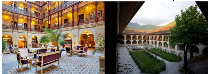
Traditional style in historic Baku

Accommodation: On this tour we offer an interesting selection of hotels ranging from the traditional to the modern. Boutique hotels with sufficient rooms for a small group are hard to find but we are sure you will not be disappointed. In Baku our hotel is located in the heart of the old walled city and offers wonderful Azerbaijani elegance. In Sheki we stay in an 18 th Century caravanserai. It's basic with private facilities and it's wonderful. Our hotel in Tbilisi is modern and comfortable and well located. In the mountains in Gudauri we overnight in a mountain chalet and in Yerevan we stay in a wonderful hotel in the heart of the city.