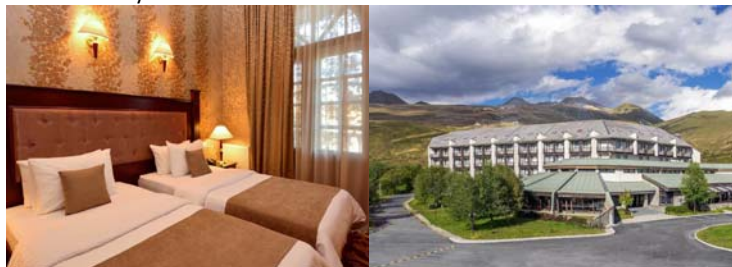
4 Star comfort by the river in Tbilisi