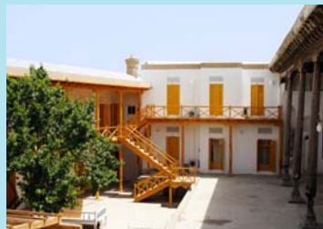
Bukhara courtyard hotel