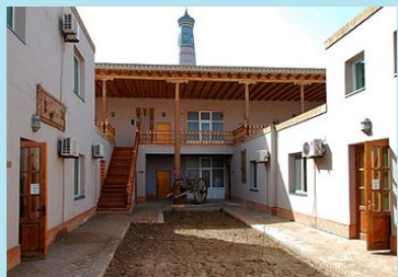
The best location in Khiva