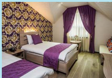
Comfortable 4* hotel in Tashkent

Accommodation: Contrary to popular opinion, Uzbek hotels are fine. Rooms can be quite small and 4* hotels might be considered closer to 3* by international travellers, but we've selected what we think are some of the best hotels in the country, in terms of character, service and location. In Tashkent we stay in a lovely modern hotel in a quiet neighbourhood. Similarly our hotel in Samarkand is modern and very comfortable whilst In Bukhara our small, Uzbek-style hotel gets great reviews. In Khiva our hotel lies by the main gate of the old city and is the best location in town.