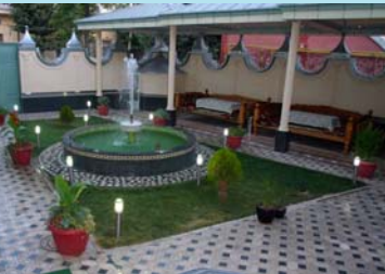
Courtyard coffee shop in Samarkand

Food and drink: Breakfast is included every day. Elsewhere, we enjoy the great variety of local food on offer. Beer, wine, vodka, soft drinks, tea, coffee and bottled water is all widely available.