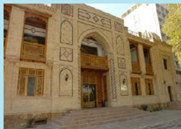
Traditional-style hotel in Samarkand