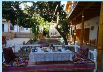
Coffee Uzbeki style